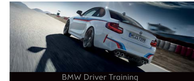
BMW Driver Training