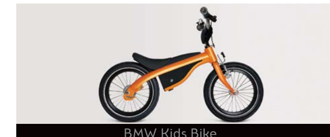
BMW Kids Bike