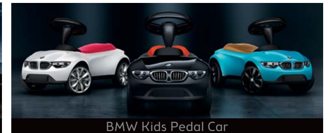
BMW Kids Pedal Car