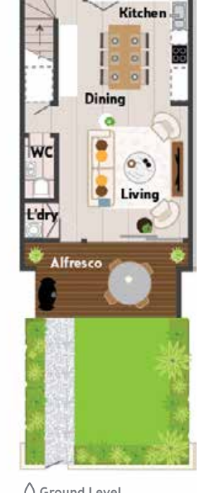
Garage 15m<sup>2</sup> Total 135m<sup>2</sup>