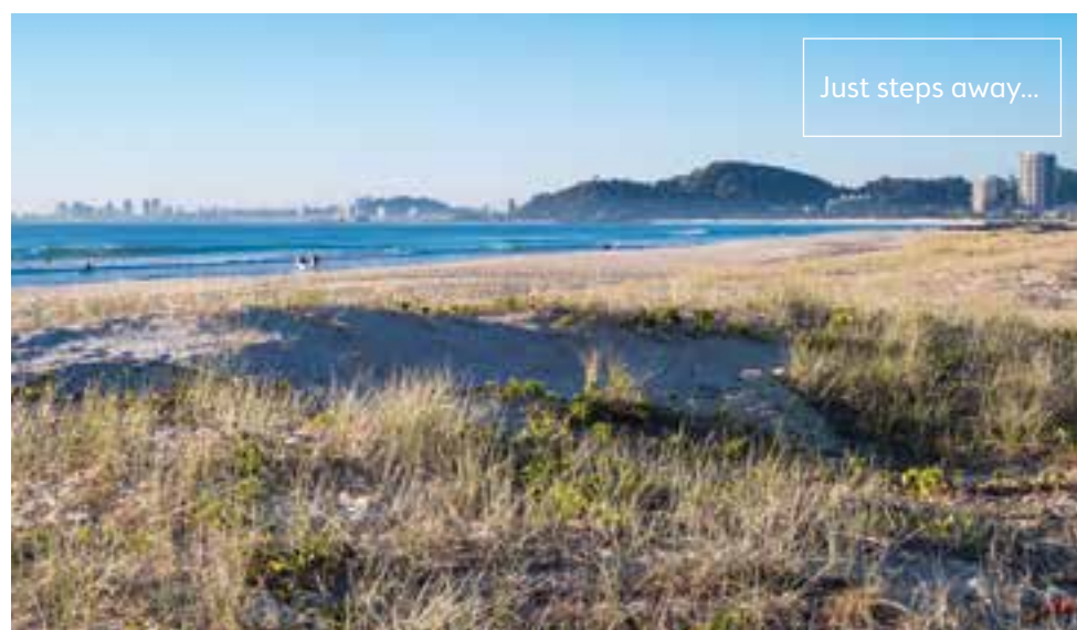
Just steps away...

Take a stroll along the endless stretches of golden sandy beaches. Your new home is just minutes away from the region's best restaurants, cafes and shops, 10 mins from Coolangatta Airport and 15 mins from the iconic Surfers Paradise.