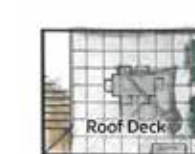
Top floor ▲

Located in one of the most sought after areas in the "golden triangle" of Alexandra Headland. This beautifully appointed home comes with the convenience of low-maintenance beachside living, without compromise on location, quality or lifestyle. Relax with family and friends on your own rooftop terrace. Soak up the views, breathe in the sounds of the ocean and enjoy all this home has to offer.