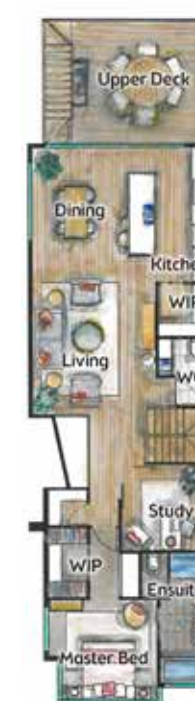
Second floor ▲