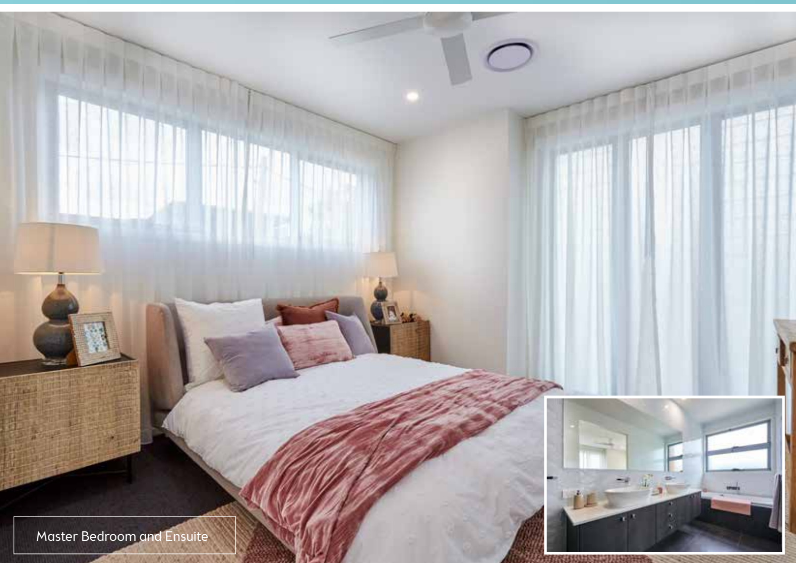
Master Bedroom and Ensuite